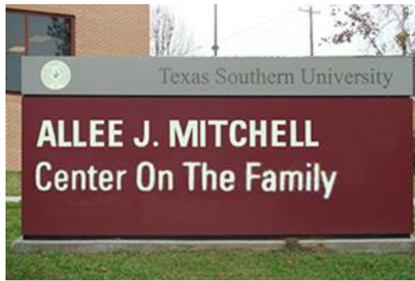
Sign at Texas Southern University