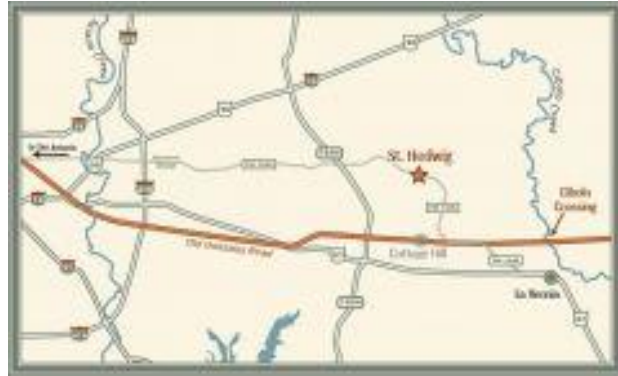
Map of St. Hedwig, Texas