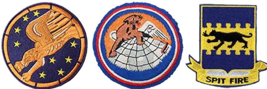
Tuskegee Airmen Patches for the 99th FS, 100th FS, and the 332nd FG

On April 25, 1941, he enlisted in the Army Air Corps. He trained at San Angelo, Texas and Chanute Field, Illinois as an aircraft armorer, and was attached to the famous