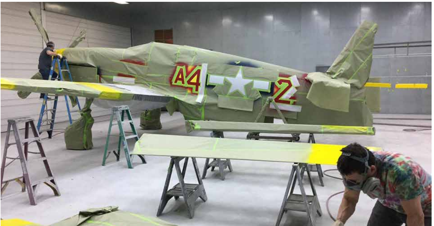
Jim Hutchison applying multiple a multiple color layup scheme