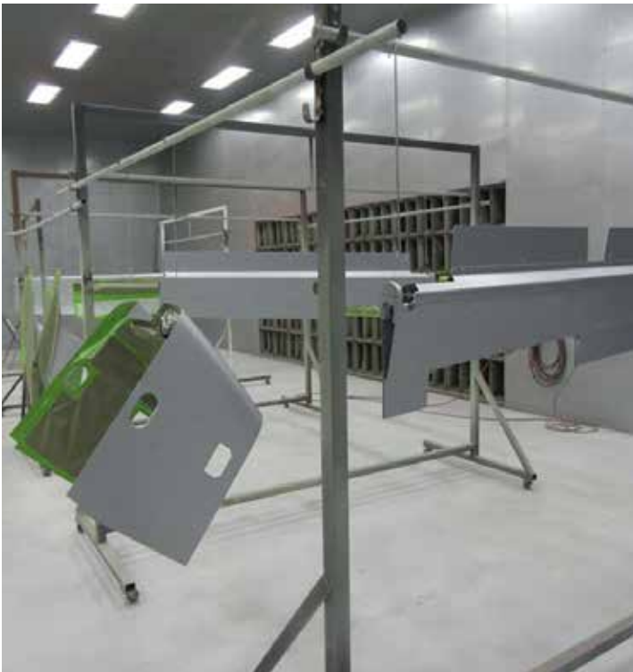
Painted and pre-assembled control surfaces and other parts on the P-51C Mustang Tuskegee Airmen for layout and design scheme application