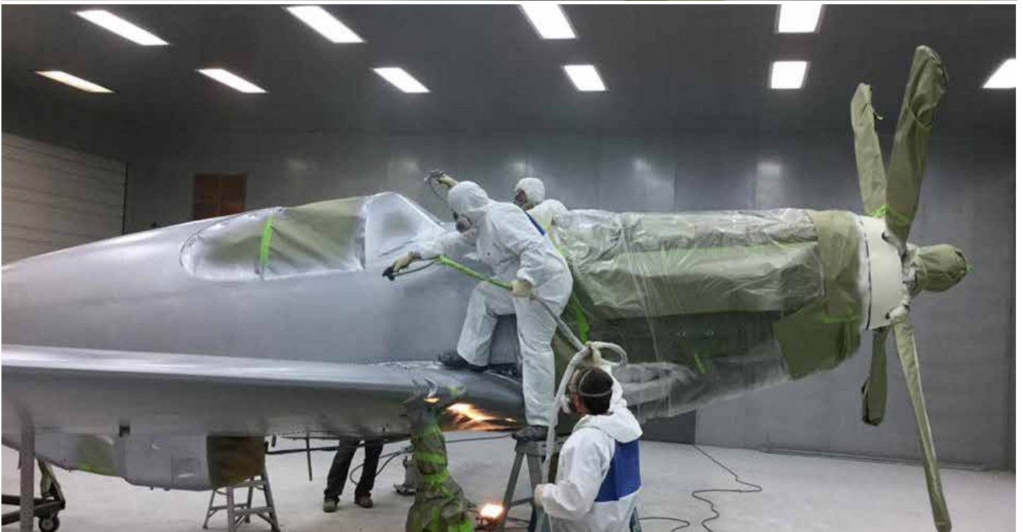
P-51C Mustang Tuskegee Airmen getting a coat of silver metallic basecoat