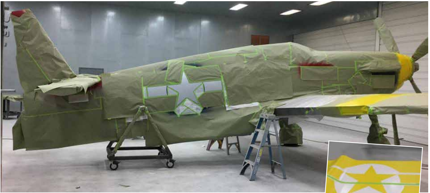
Back masking in between colors, prepped for the white star